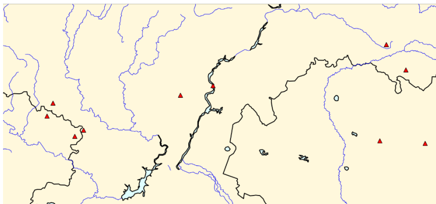
Figure 2. Linaria cretacea distribution: triangles marking the species locations in Eastern Europe and Northwestern Kazakhstan

In each of these zones, L. cretacea is associated with steppe landscapes wherever chalk outcrops pierce the surface. The composite map (Fig. 2) displays all verified localities taken from literature, herbarium specimens, and fieldwork.