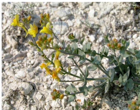
Figure 4. Chalk toadflax ( Linaria cretacea ) on an open chalk slope, ID:44-228-5009 [10]

rock or a thin layer of humus over chalk rubble, an extreme edaphic environment with very high calcium carbonate content. The species is absent from areas where continuous turf has formed on the chalk; it prefers fresh erosional landforms such as scree slopes, gully walls, and isolated outcrop hills. In the Cis-Urals and northwest Kazakhstan, these chalk ridges — locally known as “chalk mountains” — rise 150–200 m above the surrounding semi-desert steppe plain. A typical habitat with scattered individuals on an open chalk slope is shown in Figure 4.