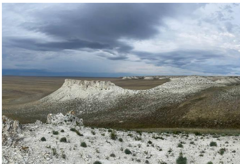
Figure 1. Ishkargantau chalk massif

Particular attention was paid to current locations in Kazakhstan. In 2023, a study of natural cenopopulations of L. cretacea was conducted in the natural population of the species in the Ishkargantau chalk massif (Fig. 1).