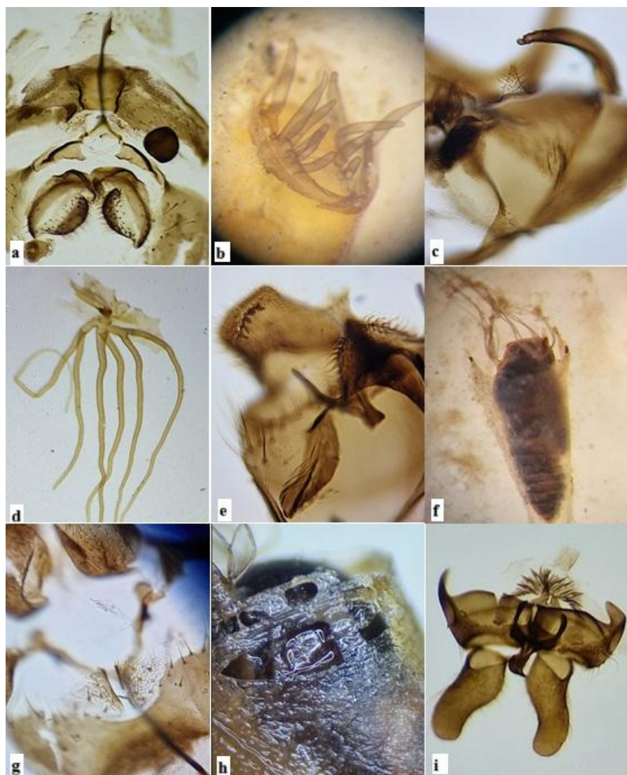
Figure 1. Morphological features of black flies: (a) Female genitalia of Wilhelmia equine ; (b) Pupal respiratory filaments of W. equine ; (c) Male genitalia of W. equine ; (d) Pupal respiratory filaments of Boophthora erythrocephala ; (e) Male genitalia of B. erythrocephala ; (f) Pupa of Odagmia ornate on substrate (plastic bag); (g) Female genitalia of Argentisimulium noelleri ; (h) Cocoon collar of Simulium reptans ; (i) Male genitalia of S. reptans

Based on the results of the conducted research, it can be concluded that the species diversity of gnats in the Pavlodar Irtysh region is quite poor. The Shannon diversity index in the Pavlodar Irtysh region was 1.042, with an evenness of 0.647. The total number of blackfly species was 5, and the average number of individuals was 82. Based on the species composition data for each district (Table), the index was calculated separately for each district (Fig. 2).