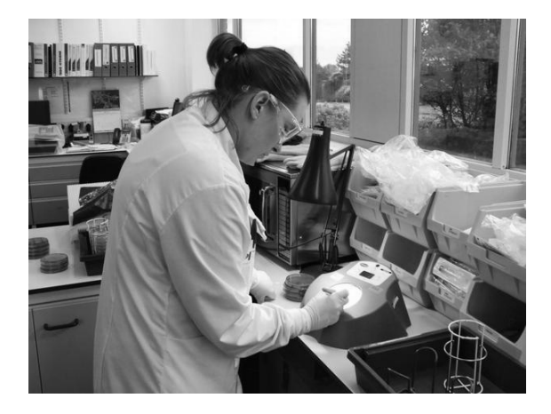
Figure 4. Laboratory worker performing colony counting