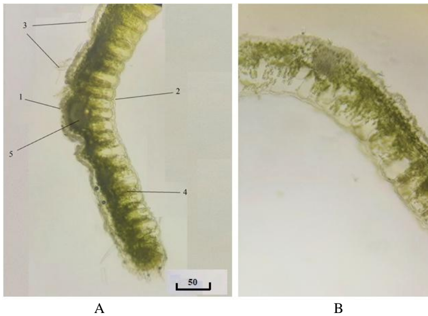
Figure 3. Cross-section of a Hedysarum gmelinii leaf, section through the midrib: A — section through the midrib, B — lateral section; 1 — lower epidermis, 2 — upper epidermis, 3 — trichome remnants, 4 — mesophyll, 5 — vascular bundle. Magnification is given in \mu\text{m}

The root of H. gmelinii (Fig. 4) is rounded with a well-defined cortex and has a secondary anatomical structure.