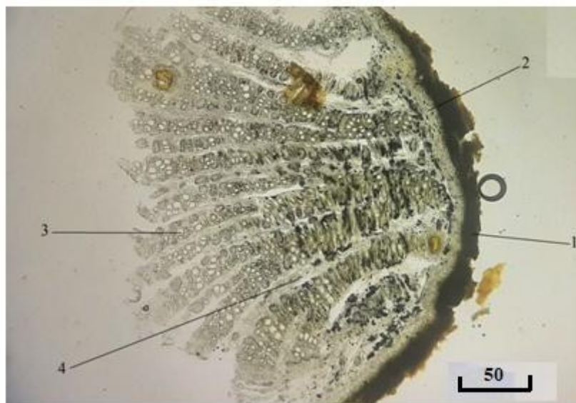
Figure 4. Cross-section of the root of Hedysarum gmelinii , fragment: 1 — cortex, 2 — cortical parenchyma, 3 — xylem, 4 — parenchymatous rays. Magnification is given in \mu\text{m}

The root of H. gmelinii (Fig. 4) is rounded with a well-defined cortex and has a secondary anatomical structure.