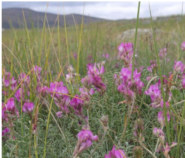
Figure 1. H. gmelinii in the flowering stage

H. gmelinii is a perennial herbaceous plant, 15 to 40 cm tall (Fig. 1). The root is short and taproot-like. The shoots are ascending or rising, ribbed, with a rough surface, and range in color from light green to greenish-yellow.