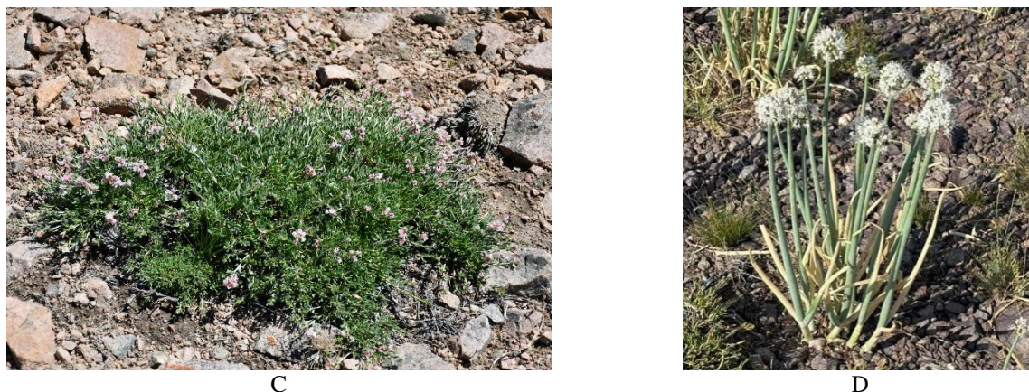
Figure 3. Examples of key species within the IPA boundaries (photographer and license indicated in parentheses for non-commercial use):

A — Tanacetum ulutavicum (V. Epiktetov, CC BY-NC 4.0); B — Tulipa patens (S. Lednev, CC BY-NC 4.0); C — Atraphaxis decipiens (V. Epiktetov, CC BY-NC 4.0); D — Allium galanthum (L. Dimeyeva, CC BY-NC 4.0)