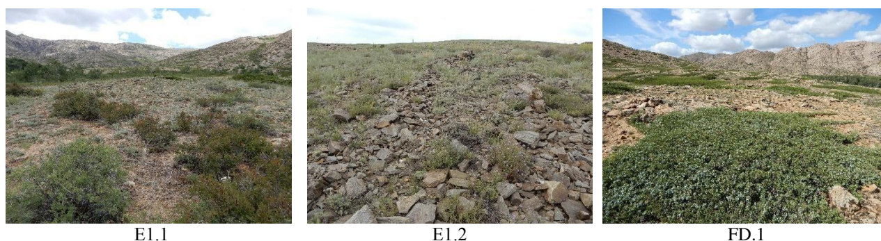
Figure 2. Habitats within the IPA boundaries

According to the EUNIS habitat classification, the site includes: E1.1 — inland sandy and rocky habitats with sparse vegetation; E1.2 — perennial calcareous grasslands of the steppe zone; FD.1 — habitats dominated by xerophytic shrubs (Fig. 2) [1, 12].